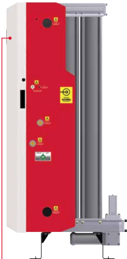
Integral Oxygen Analyser – Constant monitoring ensuring the correct gas purity.